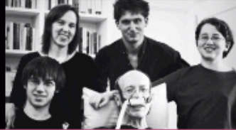
Now stricken with ALS