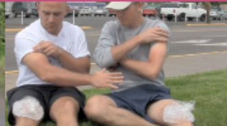
Sunburn and iced knees