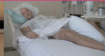
Auggie down: rhabdo