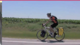
On the road again!

onward to New York Brighton Beach July 25, 2010