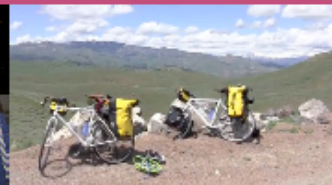
Bikes in the Idaho desert