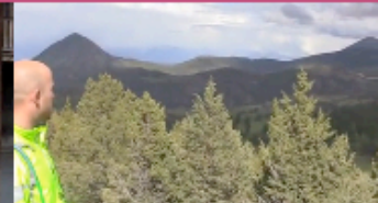
The eternal snow