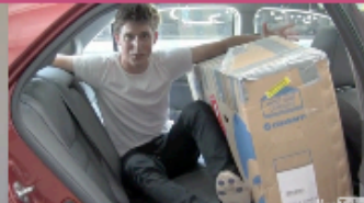
Recuperating in Chicago