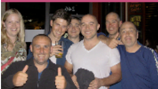
Friends in Boise